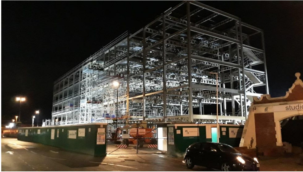
Teville Gate House construction, December 2019